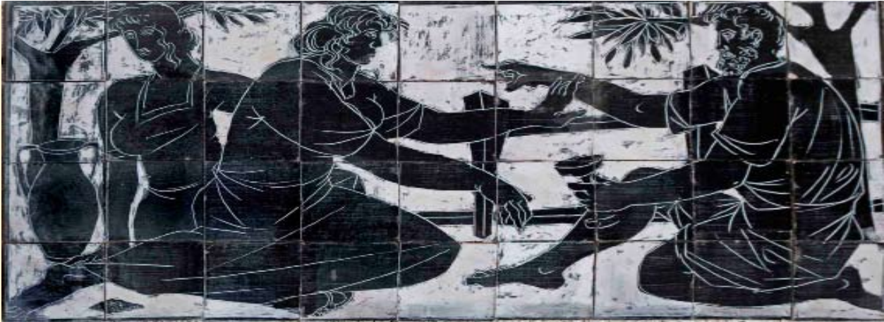
Amerigo Tot Ceramic freize (195 x 80 cm), 1952